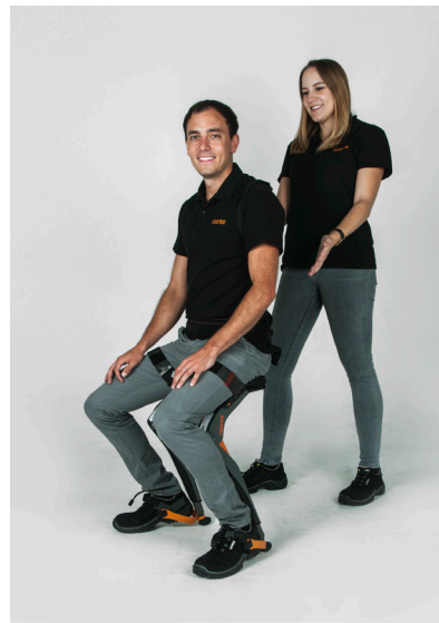
During the implementation of the Chairless Chair®: noonee specialists provide support.

By now, nearly all major car manufacturers, as well as other well-known* companies covering different sectors worldwide, use the Chairless Chair®. To ensure a smooth implementation of the product into your workplace, we follow our process developed a process (with the help of our partners in the industry) that leads to an ideal implementation. A face-to-face training on your premises, or at our academy, makes up an important part of this process. By doing this, we ensure the ideal use of the Chairless Chair®. To learn more, simply give us a call; there are no strings attached. We are also happy to provide you with information on different financing options, such as our renting or leasing models.