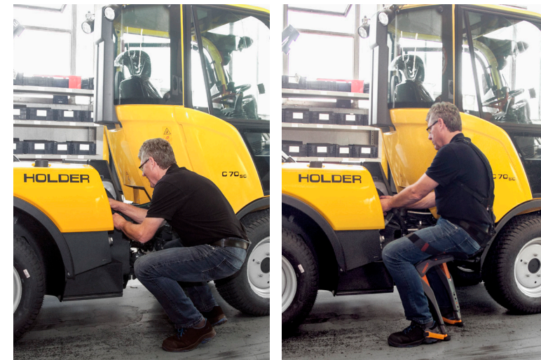
Without the Chairless Chair®: A stressful, strenuous body posture.

Creating an ergonomic, comfortable, and even more productive workplace without extensive changes at the workplace – thanks to the Chairless Chair®, this now is possible. All it takes to work in a healthy position is putting on our device, which only requires a few seconds. The Chairless Chair® allows you to effortlessly switch between an active sitting, standing, and walking position. This Innovation doesn't cost you money – it saves you money, since the use of the Chairless Chair® reduces the amount of sick days and decreases capacity constraints.