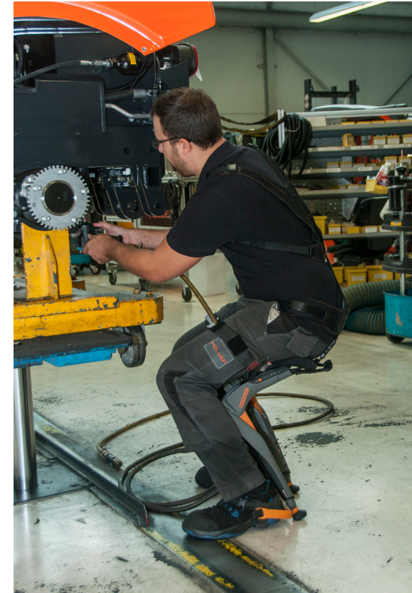
How much space does the Chairless Chair® require? None!